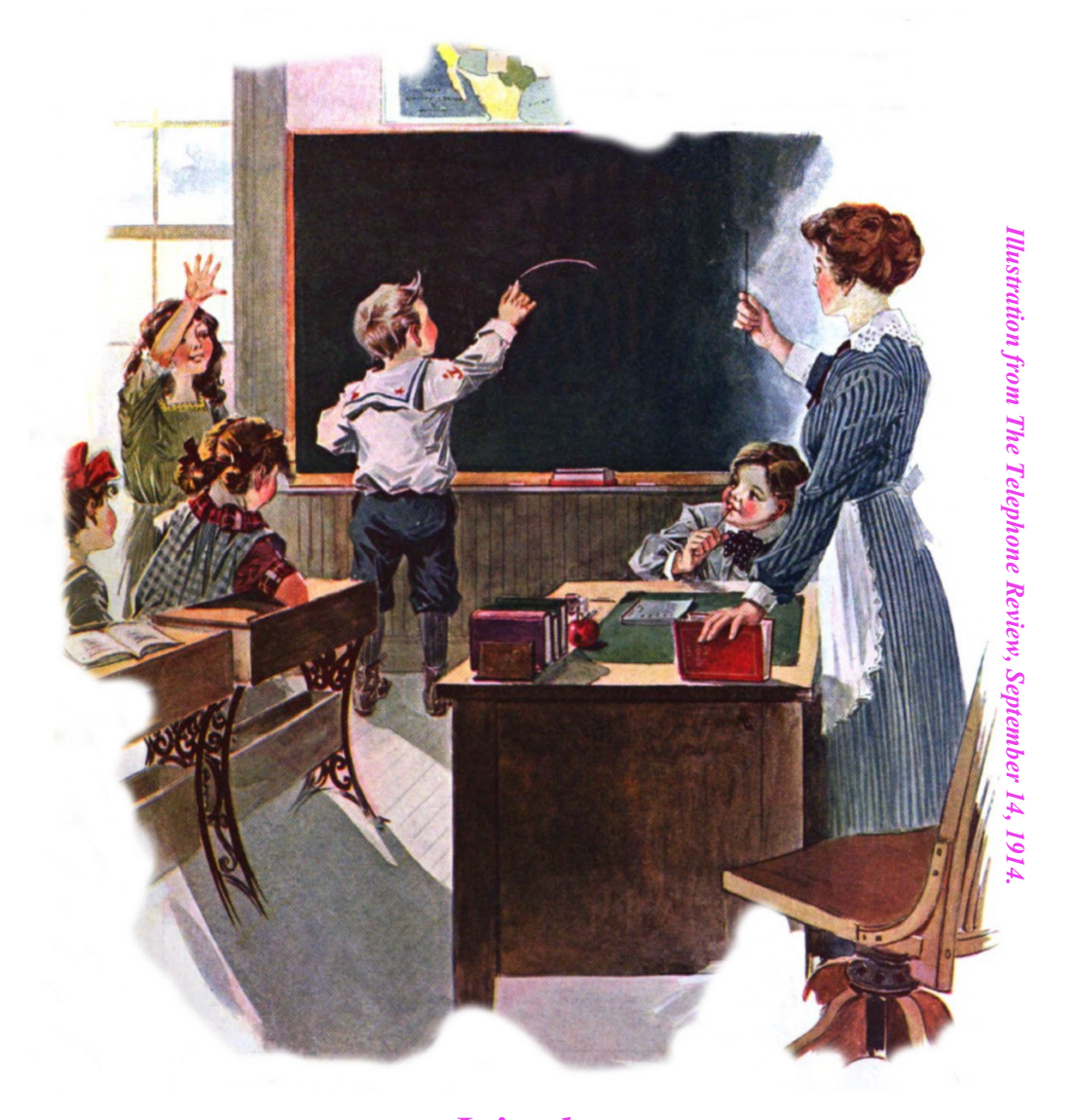
Join the Clayton / Deer Park Historical Society. (Homework optional.)